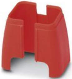
Security element for FL patch cable

Please be informed that the data shown in this PDF Document is generated from our Online Catalog. Please find the complete data in the user's documentation. Our General Terms of Use for Downloads are valid ( http://phoenixcontact.com/download )